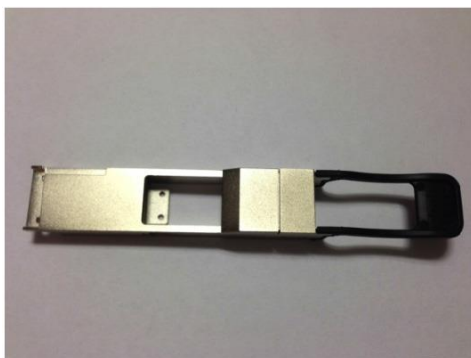
Figure 1. Cisco QSA Module